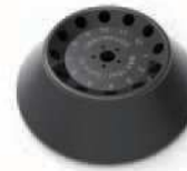
MT-B 10ml/15ml x 12