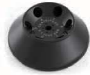
MT-C 50ml x 6