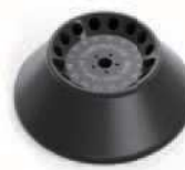
MT-A 5ml/7ml x 16